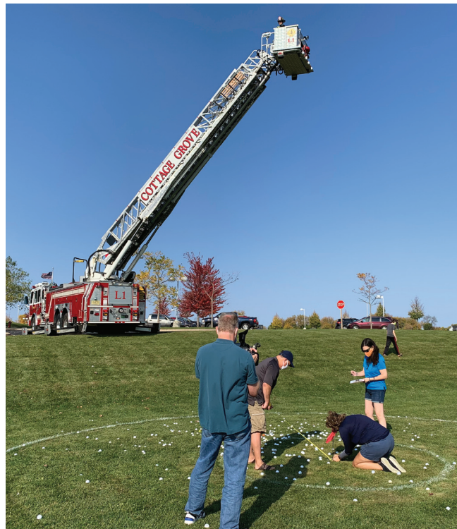
MGEF board members determine balls closest to the pin.

The Monona Grove Education Foundation supports the Monona Grove School District in pushing the boundaries of curricular and extracurricular activities throughout the District, working with teachers and staff to promote an innovative, well-rounded education inside and outside of the classroom.