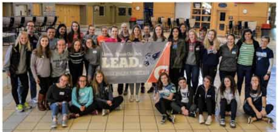
Female Athlete Summit at Monona Grove High School