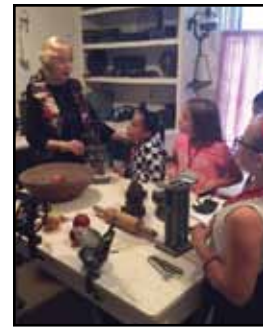
2nd graders learn about frontier era cooking