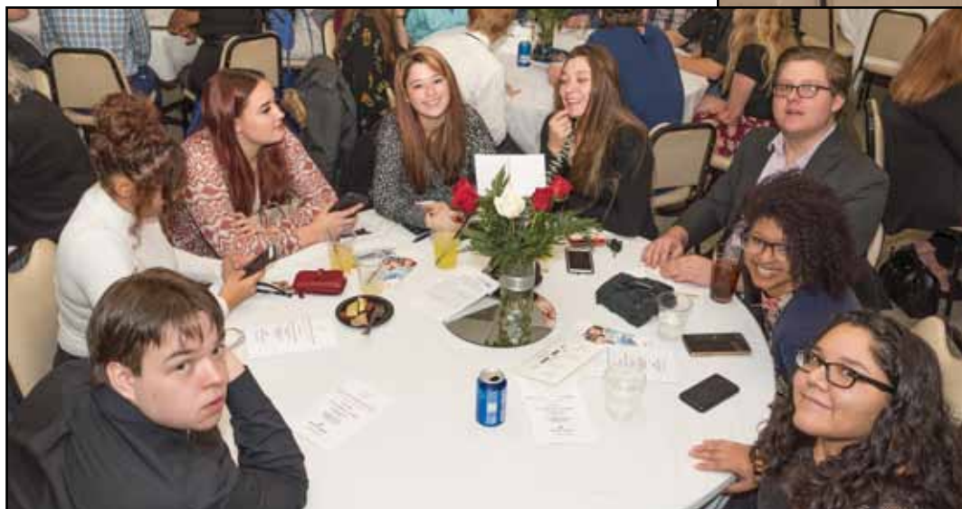
Many Monona Grove Alternative School & MG 21 graduates attended