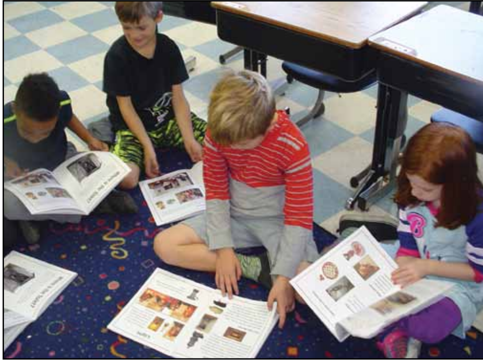
Winnequah 2nd graders enjoy reading “A Trip Back in Time”