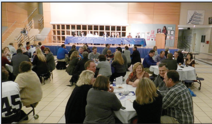
Guests enjoy appetizers & dessert

All funds raised at the event will be used for Monona Grove Education Foundation teacher grants and to establish a fund to improve the Monona Grove Klement Athletic Complex. The Education Foundation hopes to make the Gala and Silent Auction an annual event.